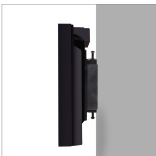
Mounts the screen 47mm from the wall, allowing easy access to connectors