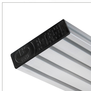
High-end aesthetic quality with stylish end caps for a neat and tidy install