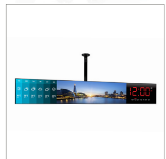
Pole mounted options are also available using System 2 poles, collars and ceiling mounts