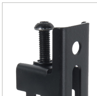
Arms feature levelling screws to adjust the screen height